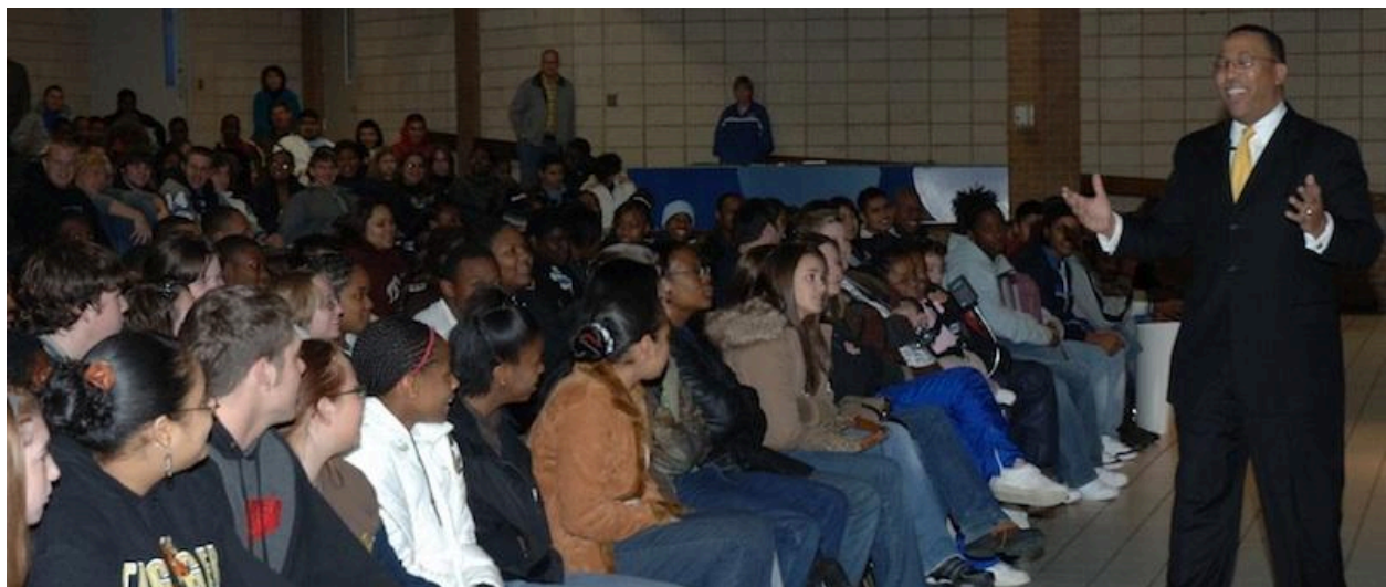
Rising 9th Graders in Kansas City Public Schools